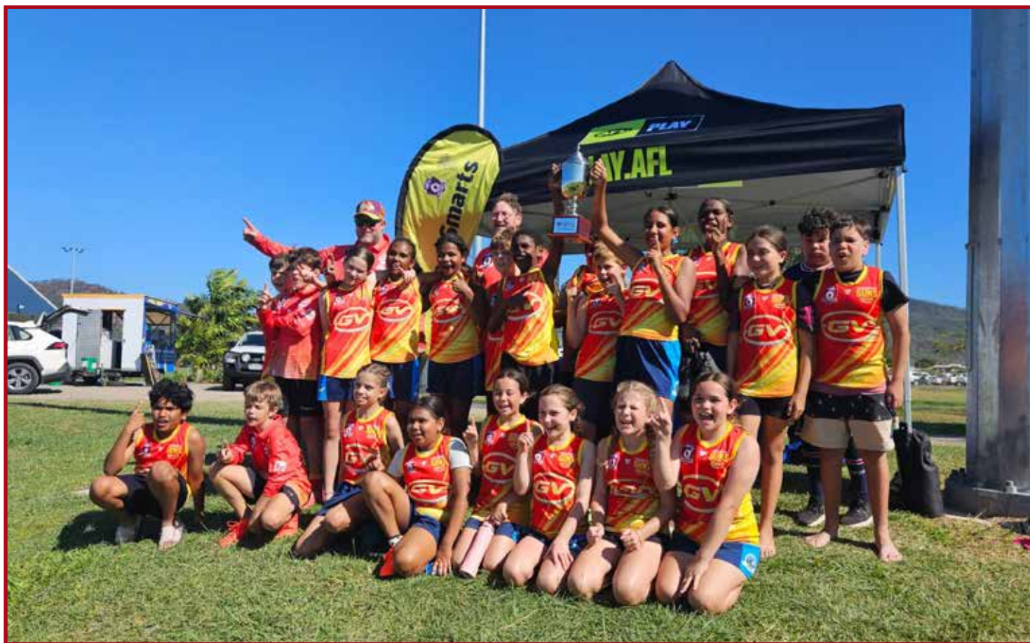
Gordonvale Junior AFL players and coaches

In a triumph of teamwork and community spirit, Gordonvale State School has been crowned the 2025 AFL North Queensland Primary School of the Year — and what a story it is.