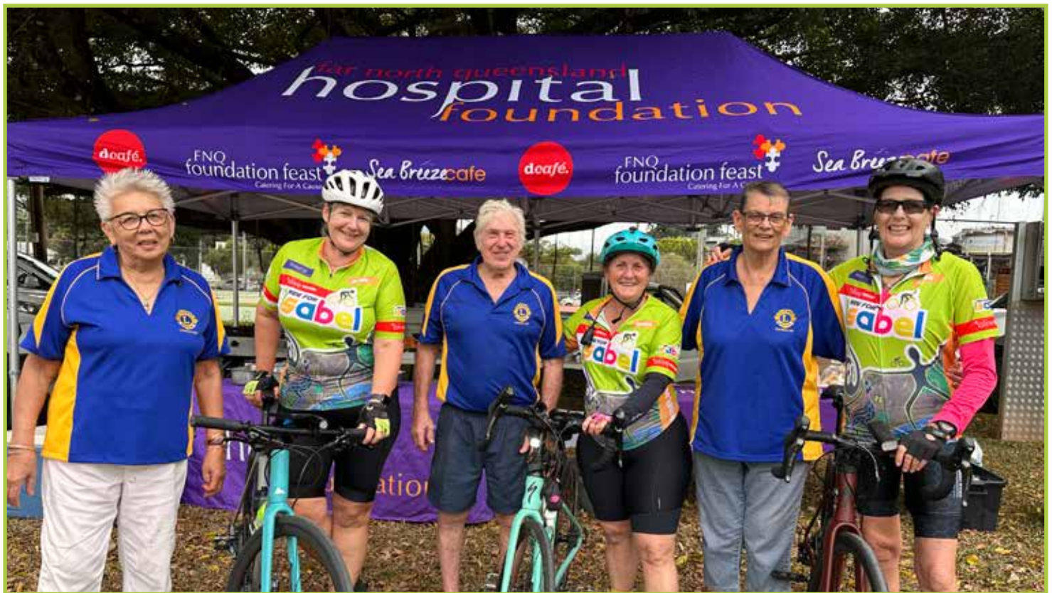
Local Gordonvale cyclists with members of the Gordonvale Lions Club.

On August 10, up to forty cyclists participated in the 2025 Alive Pharmacy Warehouse Ride For Isabel, a charity cycling event winding through the scenic cane fields around Gordonvale. Organised by the Far North Queensland Hospital Foundation, the ride supports vital neonatal care at the Cairns Hospital Special Care Nursery.