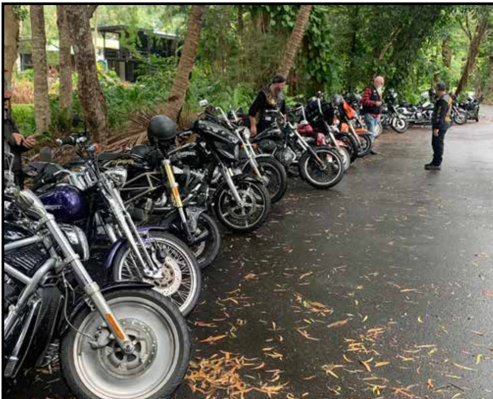
Motorbikes at Bramston Beach stop

The MBMMC includes two categories of membership: