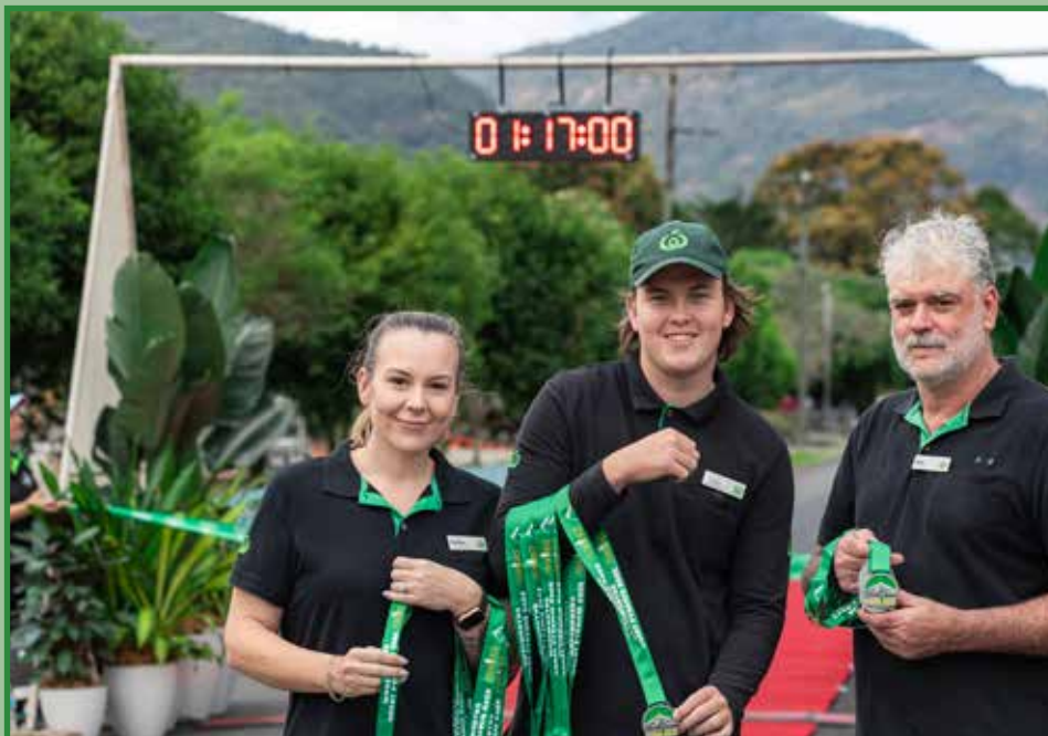
Woolworths representatives