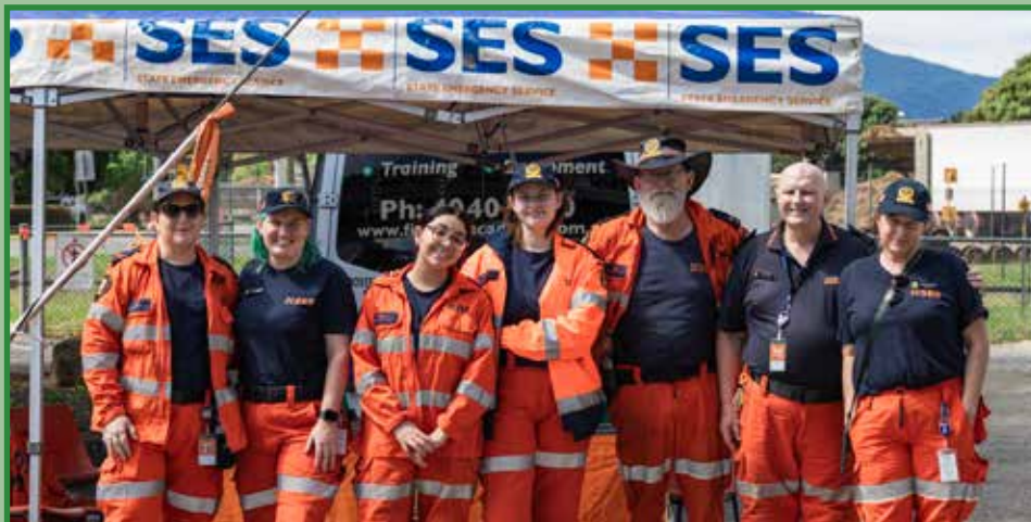
Gordonvale and Edmonton SES members